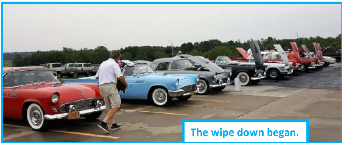
The wipe down began.