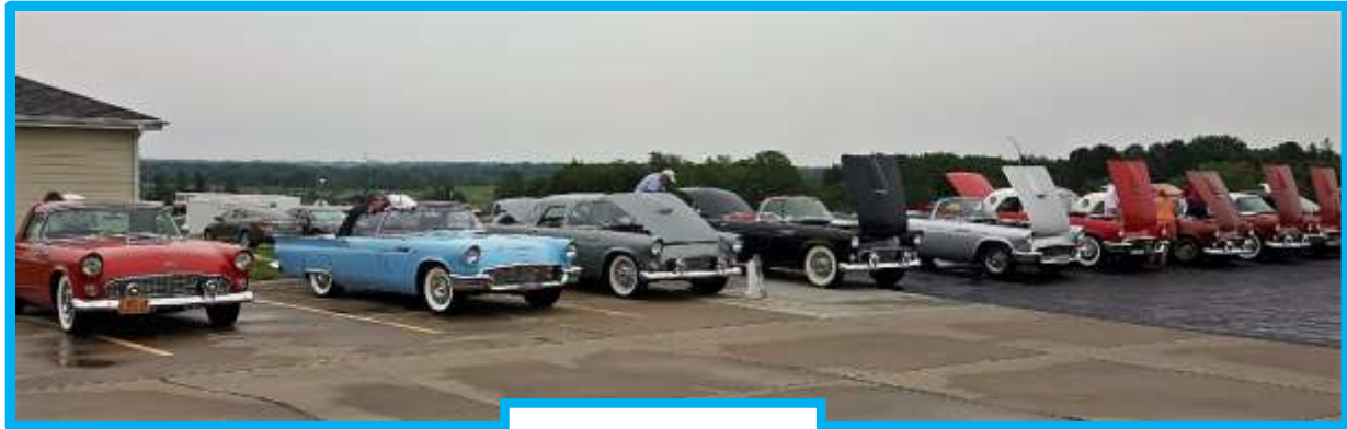
The show is on!