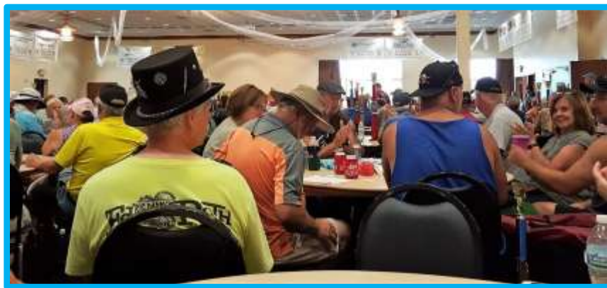
At 3:00 PM we were summoned inside for the awards ceremony.