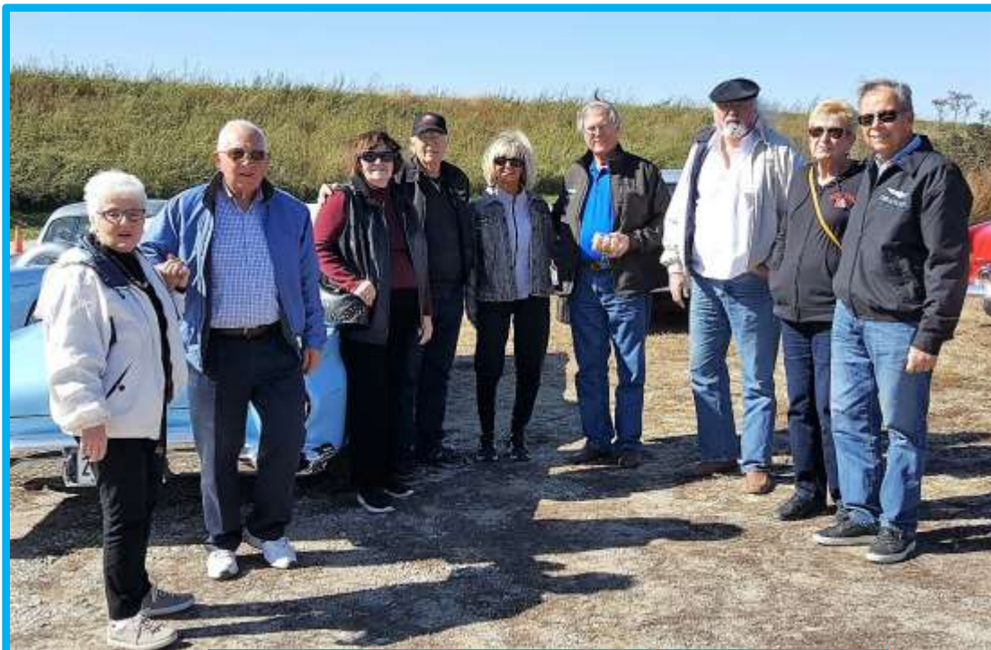
Nebraska City Impromptu Tour October 2019

The Member Profile feature needs your help. Send your story to Jack at jesanford@cox.net .