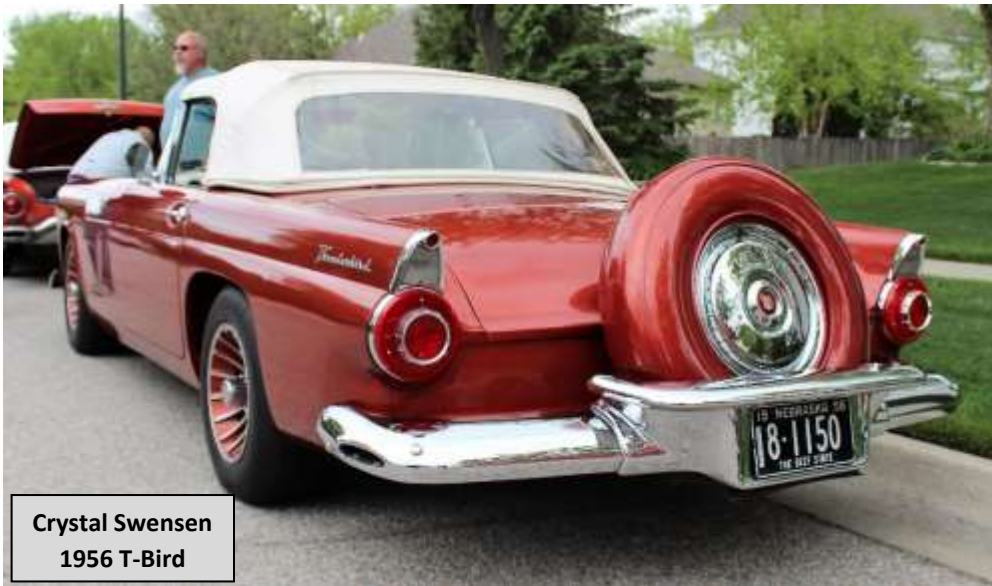
Crystal Swensen 1956 T-Bird