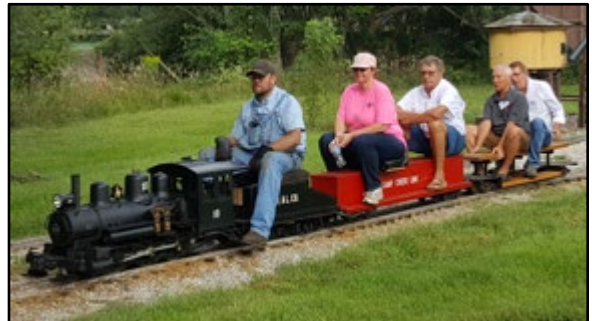
August – Rally Run and Camp Creek Miniature Train Ride

YOU CAN'T BUY HAPPINESS BUT YOU CAN BUY A THUNDERBIRD AND THAT'S ABOUT THE SAME THING