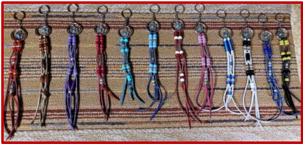
Thunderbird Key chains in Member's car color were given as party favors.