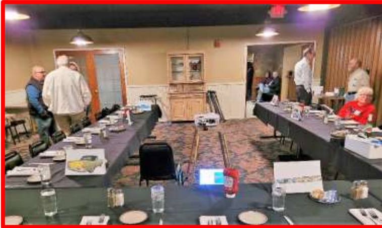
Farmer Brown's Party Room