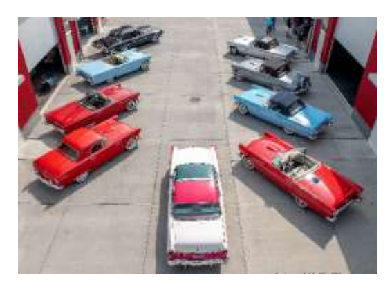
A look at the past. – May 2022

SALESMAN POSITION. The interviewer hands the man a computer and says, "Okay, sell me this computer." So, the guy picks up the computer and walks out. The next day, the interviewer calls the guy, "I need you to bring that computer back now!" The guy says, "$500 and it's yours."