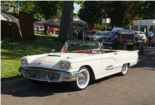
1959 Ford Thunderbird convertible

For the 1959 model year, Ford made changes to the front, rear, and side ornamentation; leather upholstery was available for the first time. The rear suspension was revised, discarding coil springs for Hotchkiss drive with parallel leaf springs. A new V8 engine, the 345-hp 430 cu in (7.0 L) MEL-series, was available in small numbers. Sales almost doubled again, to 67,456 units, including 10,261 convertibles. Thunderbird advertising in 1959 targeted women in particular, showing glamorous models in