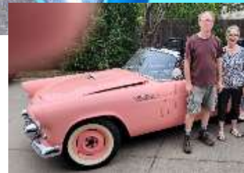
We've come a long way!!!