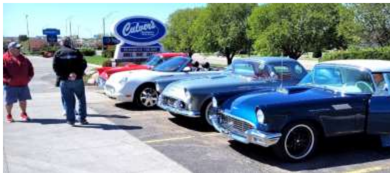
Tom's rebuilt 1957