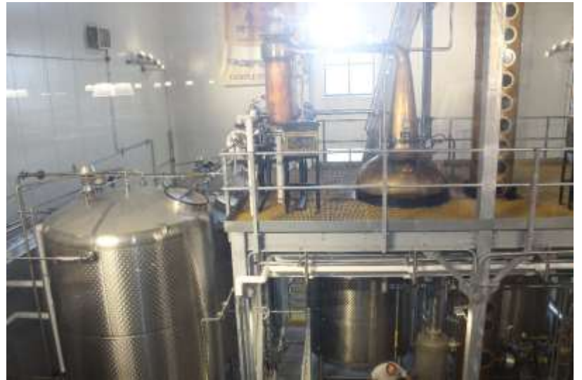
The modern workings of the distillery.